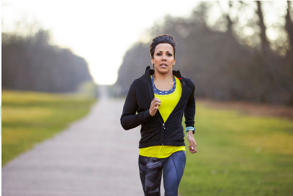
Double Gold Medal Winner Dame Kelly Holmes MBE

We need your help to raise £300,000 so that LIBRA can support the development of new and improved treatments for blood cancers and blood disorders at King's. We are half way to reaching our target, so we really need your help!